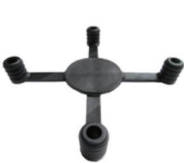
TYPE : D001

[X-LOCK]- AVAILABLE FOR RUBBER TILE OF D012 、 D059 ◦