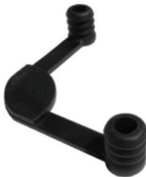
TYPE : D002